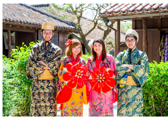
Ryukyu Costume Picture Taking