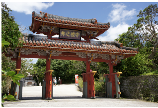
Shurei no Mon