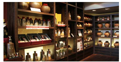
Awamori Chuko Factory & Shop