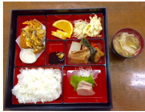
Makunouchi Bento Lunch