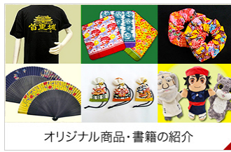
Shuri Castle Original Gifts Items